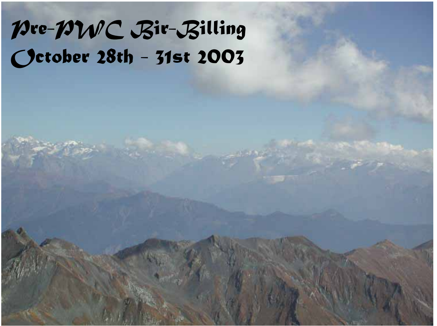
Over the back